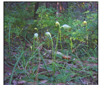
Maidenhair fern and ground orchids in Carrs Bush, Galston.