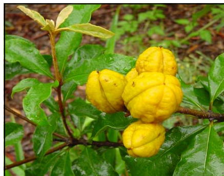
Native Pittosporum revolutum