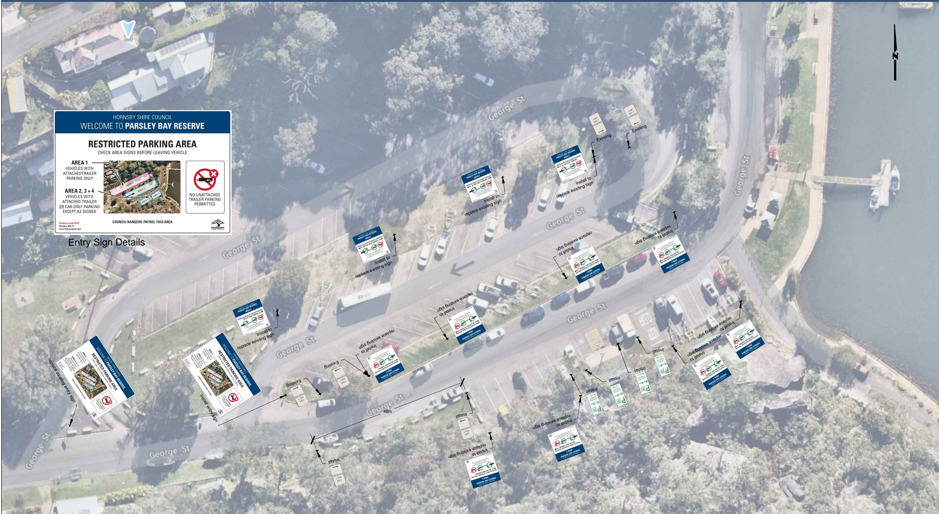
Entry Sign Details