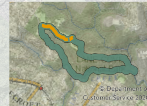
'Whale Rock' Circuit