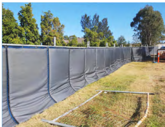
Figure 2: Sound acoustic barrier to be installed along the lower boundary of the Northern Batter.

Clearing the vegetation is likely to be the noisiest component of the works. Sound barrier fencing along the lower boundary, illustrated in Figure 2, will be installed to help soften construction noise close to adjacent residents.