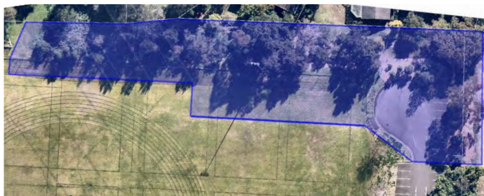
Figure 1: The shaded area will have restricted public access during the construction works at the northern boundary of Foxglove Oval.

A section of the northern area of the Oval as shown in Figure 1 is required for the works. These works are expected to have minimal impact on winter and spring sporting activities at the Oval.