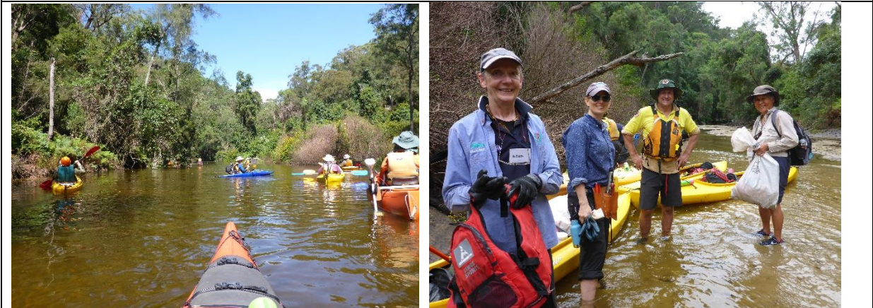
Day 1. Volunteers paddle back to the Crosslands Camp site after a fulfilling day of bush regeneration.