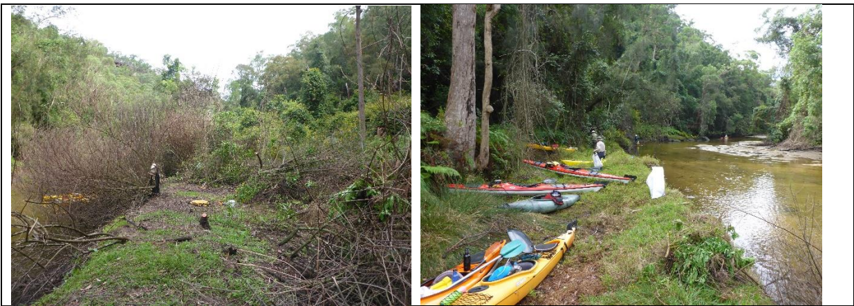
Day 1. Volunteers paddle to Calna Creek and work on Cassia and Caster Oil plants on the riverbank.