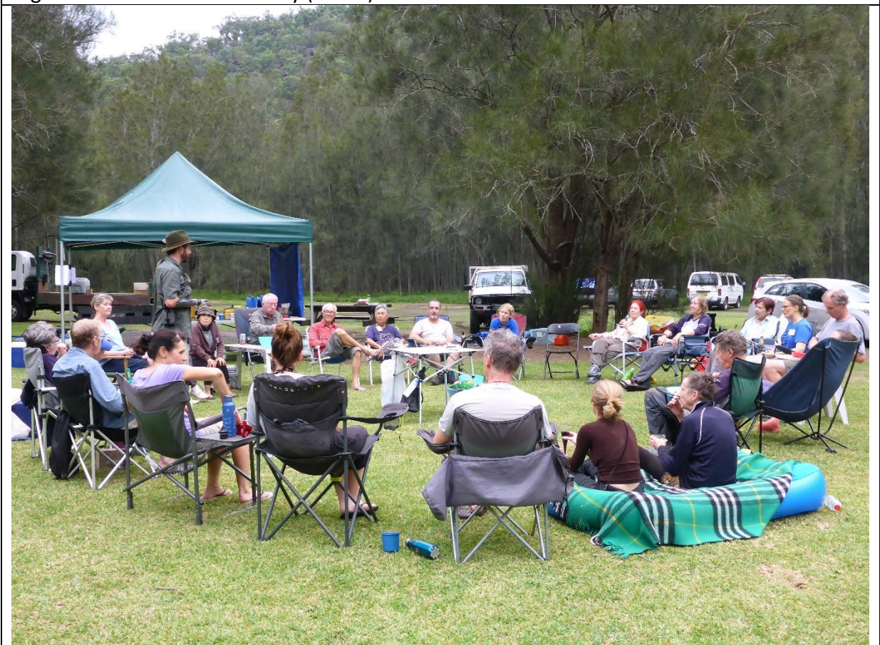
Day 1. Hooked on Nature gives the volunteers a talk on some of the native animals of the Mangrove and saltmarsh communities.