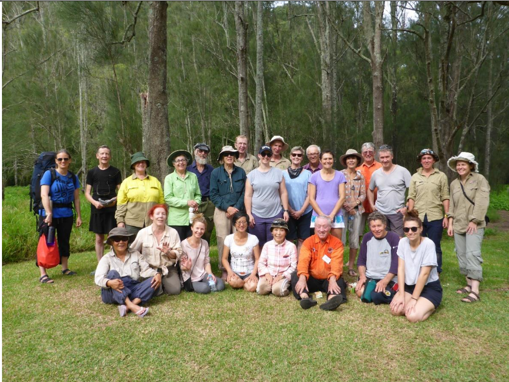
Floating Landcare 2-day camp volunteers ready to head home after a big two days of weeding, paddling, and learning, plenty of good food (Thanks to Tegan and Sheen) and as always great company.