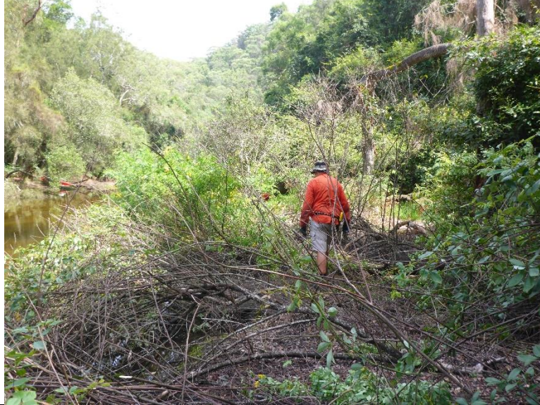
Day 2. Jeff from Willow Warriors walks along the edge of Calna Creek removing and treating cassia stands, special thanks to Jeff and team for organising the canoes for the weekend and for being our expert river guides.