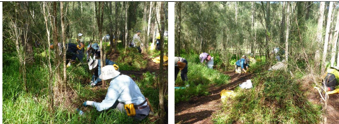
Day 1. Volunteers work on removing buffalo grass from the saltmarsh beside the camp site on Berowra Creek, Crosslands.