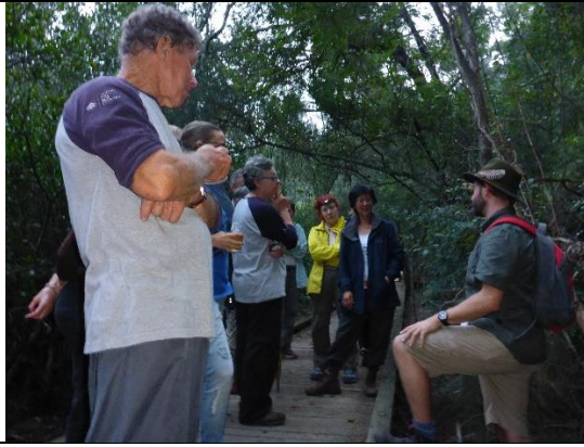
Day 1. Hooked on Nature explains the importance of the invertebrates of the mangroves and saltmarsh and takes the volunteers on a nocturnal walk.