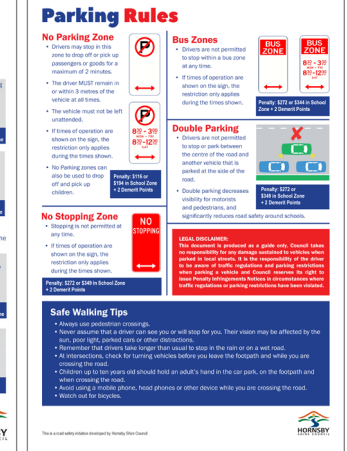
Above: A4 double-sided Parking Rules / Safe Walking Tips