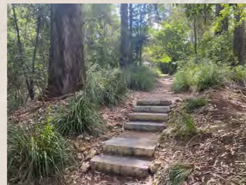
Example - Stone Steps