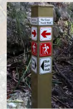
Example - Track Head and Directional Signage