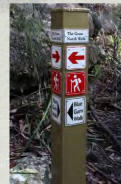
Example - Track Head and Directional Signage