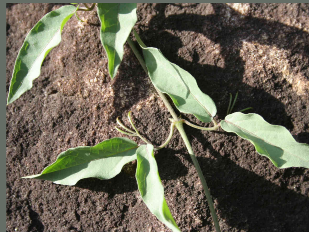
Cats Claw Creeper ( Dolichandra unguis-cati )