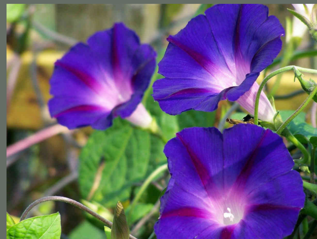
Morning Glory ( Ipomoea species )