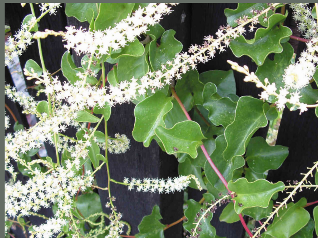
Madeira Vine ( Anredera cordifolia )