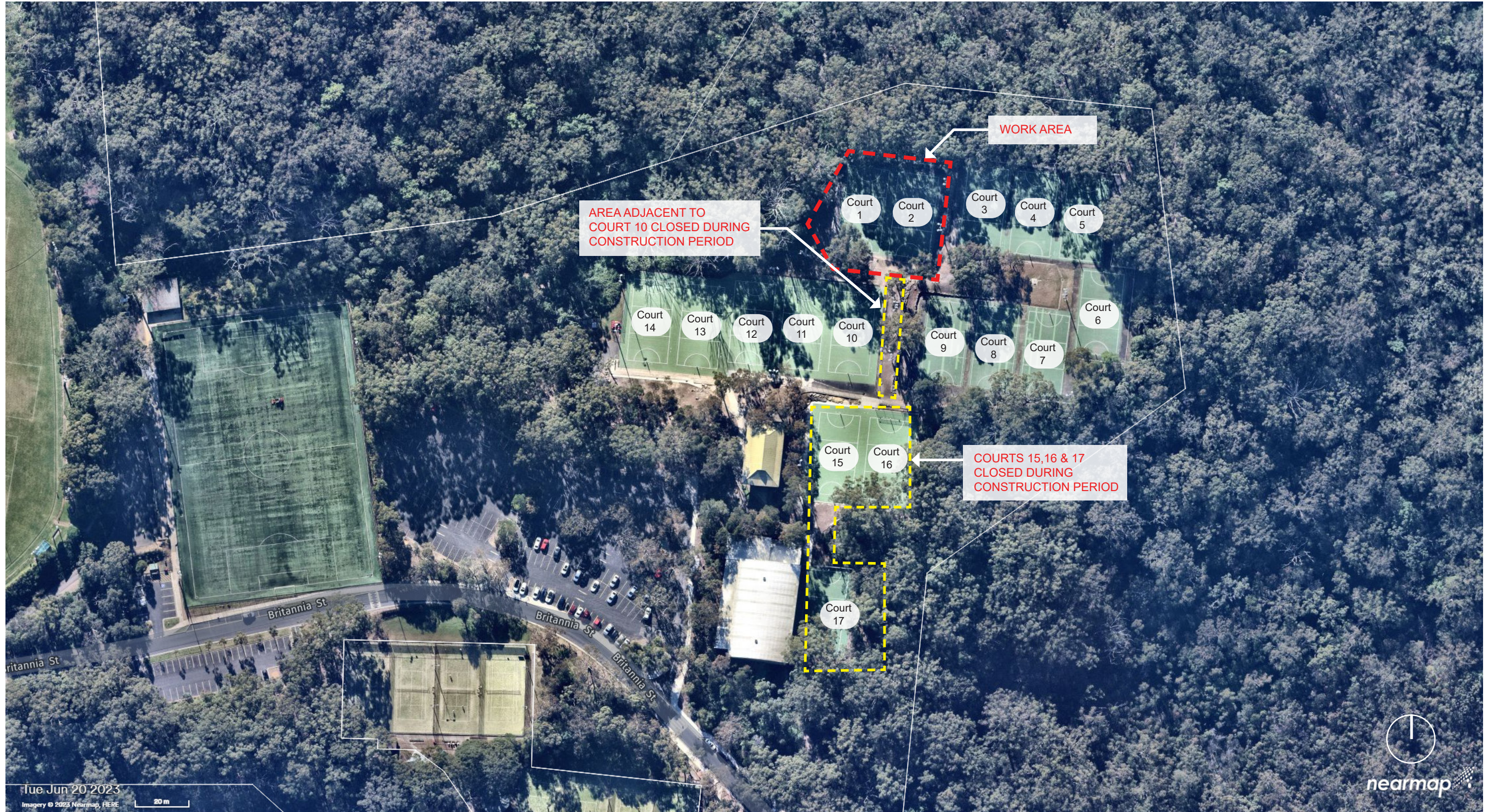
Tue Jun 20 2023 Imagery © 2023 Nearmap, HERE 20 m Aerial Map Source: Nearmap 20 June 2023