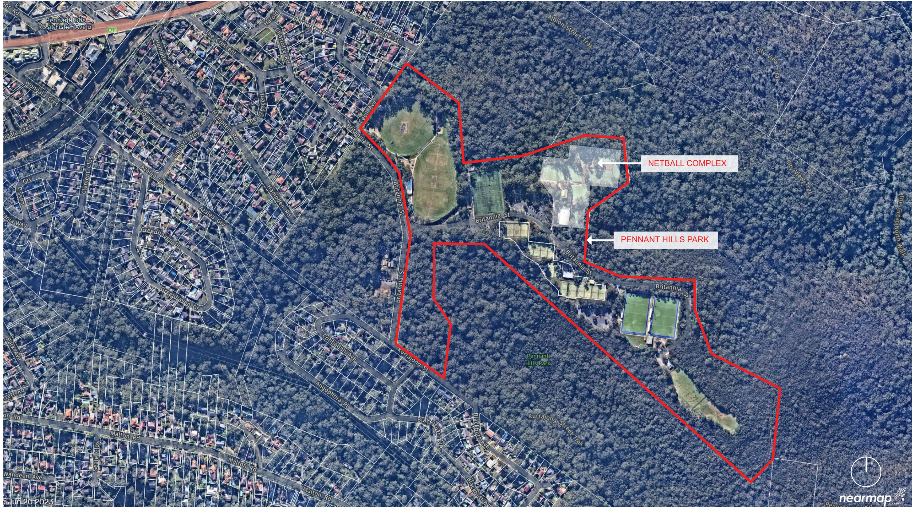
Aerial Map