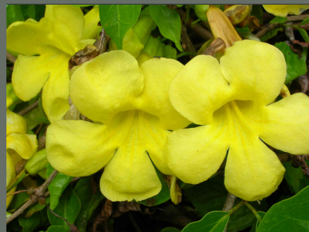
Attractive yellow flowers are the reason for this weeds introduction.

Cats Claw Creeper is one of the worst vine weeds found in Hornsby Shire. Grown as an ornamental plant, it quickly escapes gardens and becomes a major problem, especially in bushland. It smothers native vegetation, damages infrastructure and can even bring down large trees.