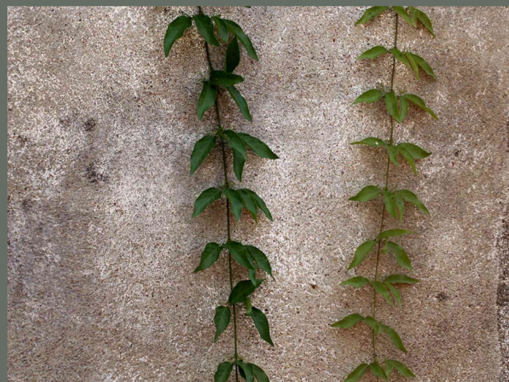
The start of a Cats Claw Creeper infestation. Man-made infrastructure is not immune.