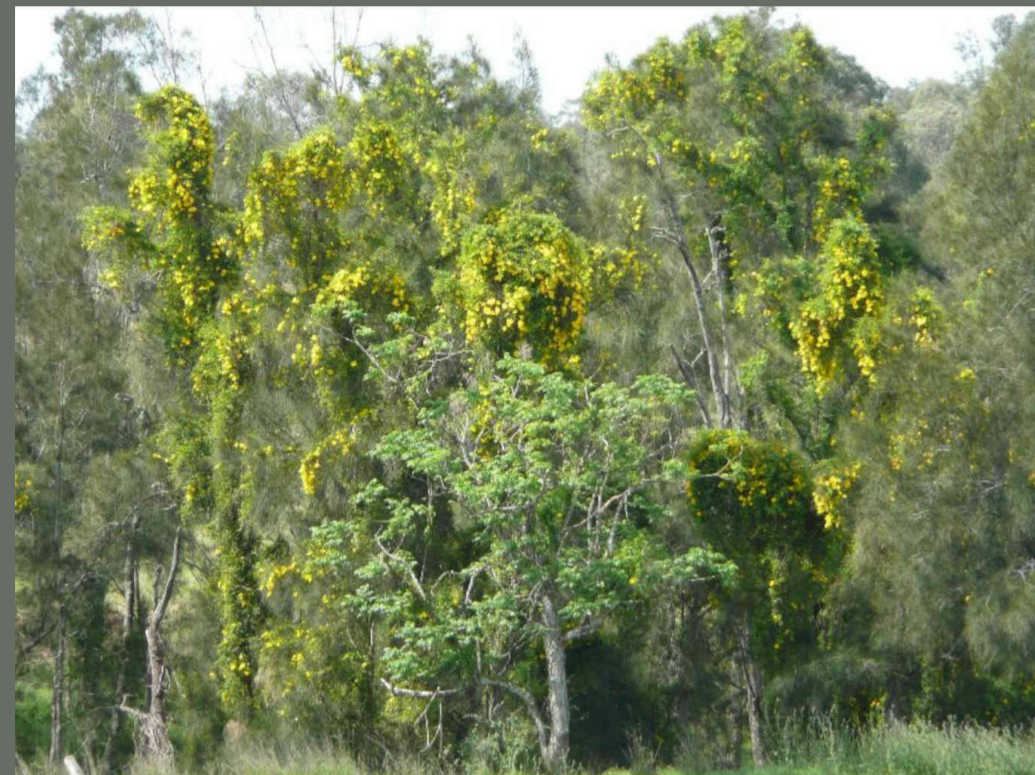
Cats Claw Creeper smothering native vegetation.