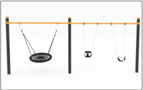
Double bay swing set with basket seat