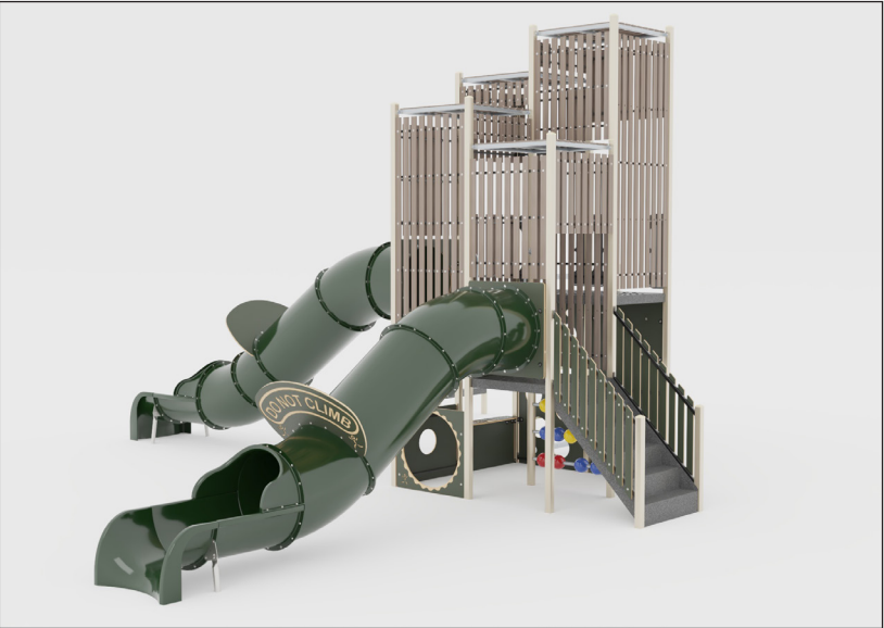
Climbing frame with monkey bars, double slides, rock climbing, imaginative play shop front, rope wall