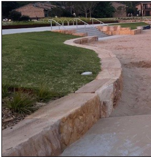
Informal sandstone seating