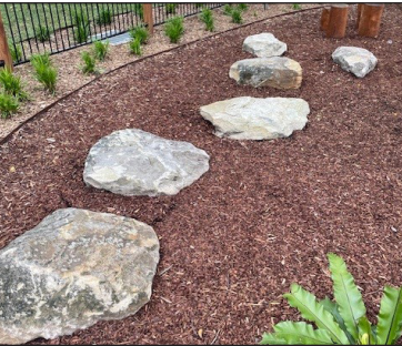
Sandstone stepping stones