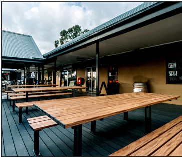
Timber look aluminium picnic setting