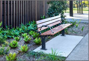
Timber look aluminium park seats