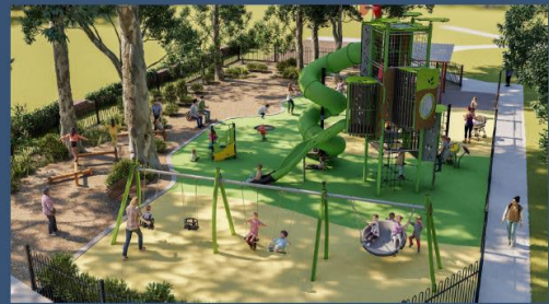
OPTION 2 - Fairytale Theme