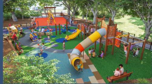
OPTION 1 - Nursery Rhyme Theme