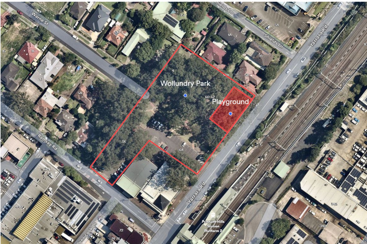
Image 1 – Proposed site of the playground upgrade at Wollundry Park

Wollundry Park is located at 60-62X Yarrara Road, Pennant Hills. The proposed playground upgrade is located in the same location as the existing playground on the southeastern side of the park next to Yarrara Road.