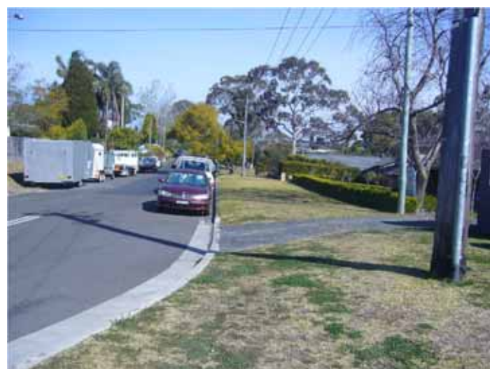
ARCADIA CRESCENT LOOKING SOUTH FROM No.33