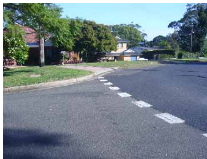
ARCADIA CRESCENT LOOKING NORTH FROM CREOLE STREET