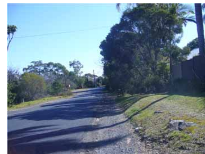
ARCADIA CRESCENT LOOKING NORTH FROM No.75 BEROWRA WATERS ROAD