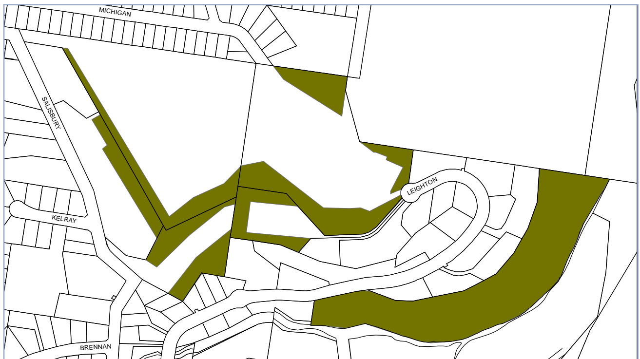
Figure 5.1(c) Location of potentially significant flora and fauna habitats on industrial zoned land at Asquith/Hornsby. (C)