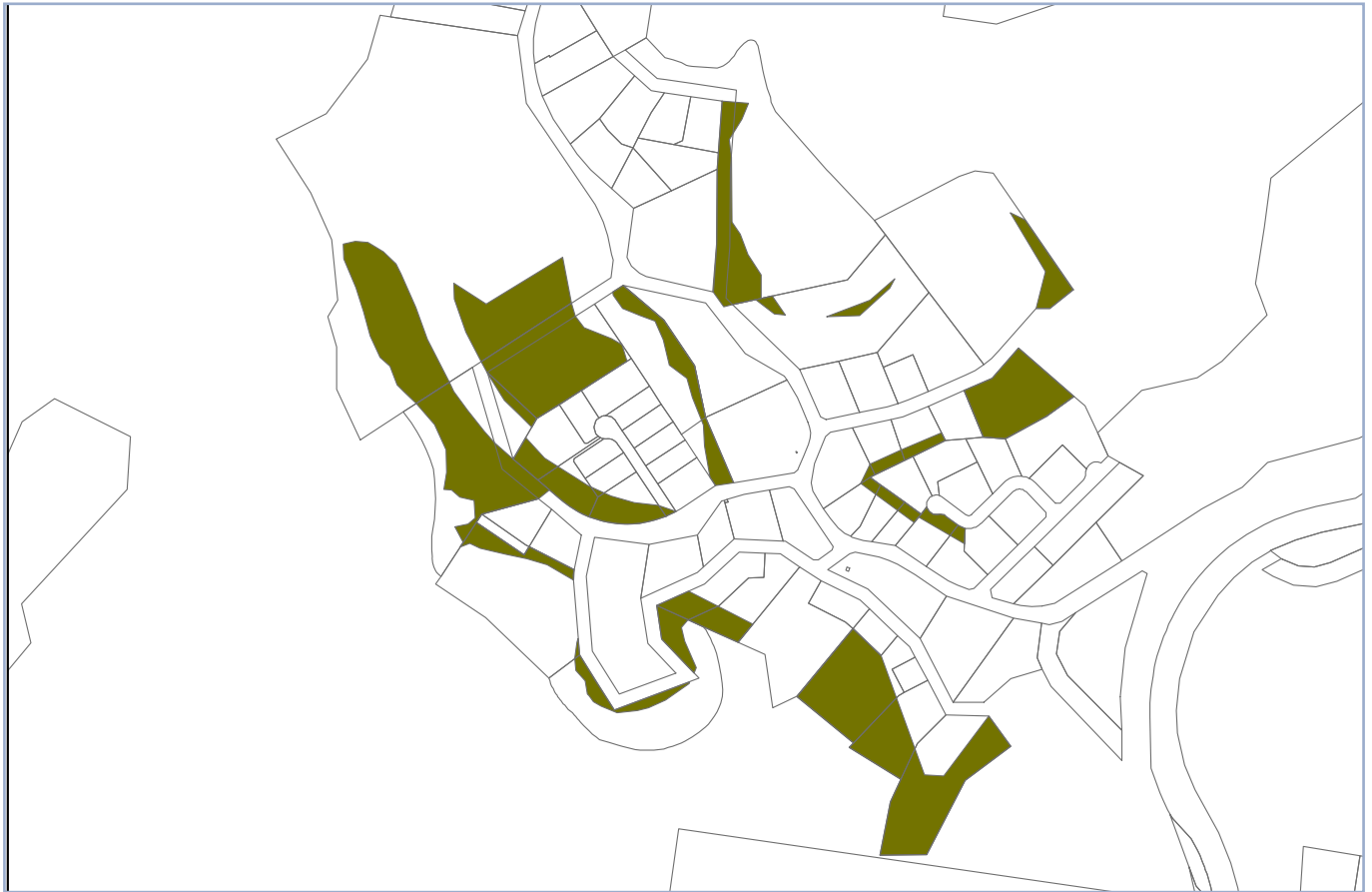
Figure 5.1(b) Location of potentially significant flora and fauna habitats on industrial zoned land at Mount Kuring-gai. (C)