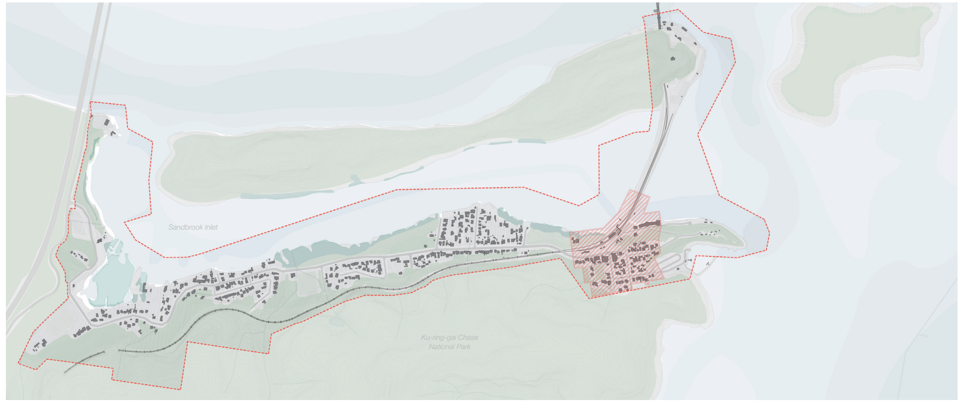
Brooklyn Improvement Masterplan - General Study Area

The Brooklyn Improvement Master Plan will provide a creative and innovative framework to strengthen the local area while ensuring Brooklyn's character is preserved and enhanced. The Master Plan will synthesise the goals developed through rigorous community engagement and result in a realistic plan for implementing its recommendations.