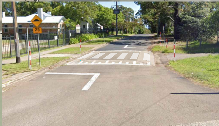
SCHOOL ROAD ARTIST'S IMPRESSION OF PROPOSED CROSSING