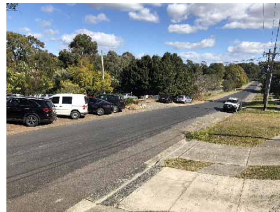
SITE PHOTOGRAPH LOOKING WEST FROM No.31