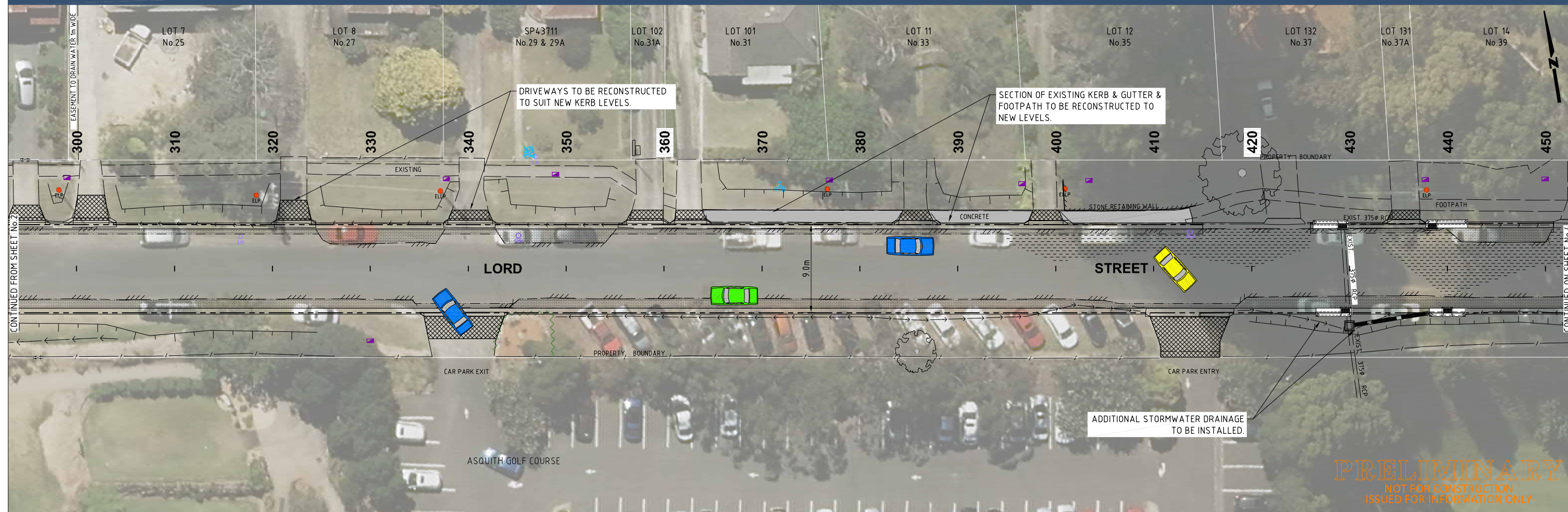
PLAN SCALE 1:200