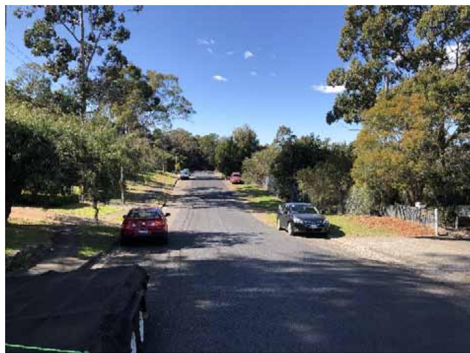
SITE PHOTOGRAPH LOOKING EAST FROM OPPOSITE No.35