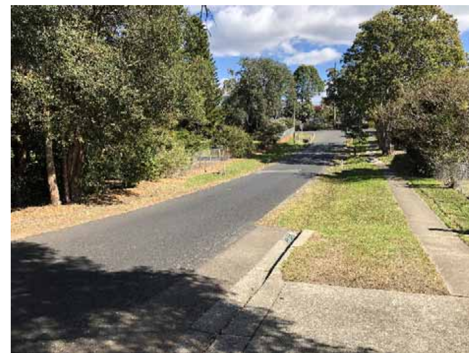
SITE PHOTOGRAPH LOOKING WEST FROM No.3