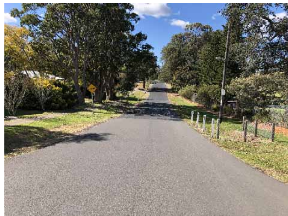
SITE PHOTOGRAPH LOOKING EAST FROM ROYSTON PARADE