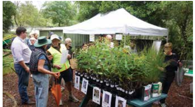
Native Plant Giveaway