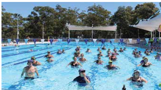
Hornsby Aquatic and Leisure Centre