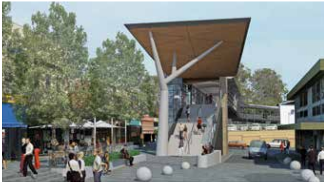
Hornsby Station Footbridge (Artists impression)