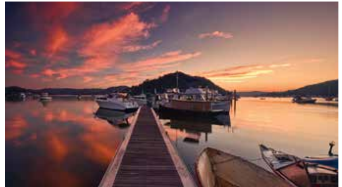
Hawkesbury Sunrise - Brooklyn