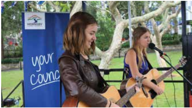
Australia Day in Hornsby Park