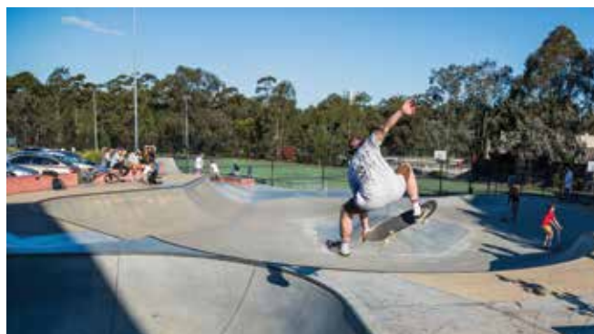
Cherrybrook Skate Park