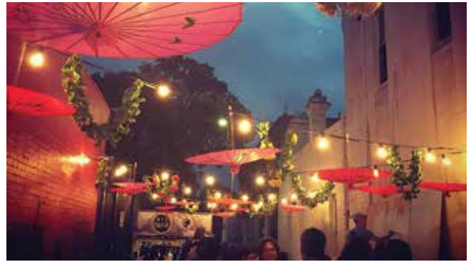
Westside Vibe street event