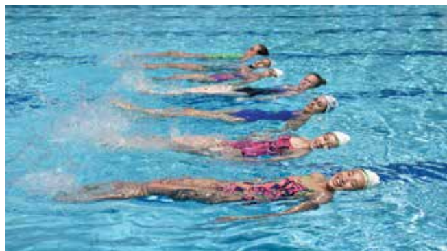
Hornsby Aquatic and Leisure Centre - Pool Party