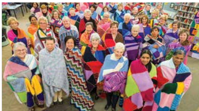
Library Knit In