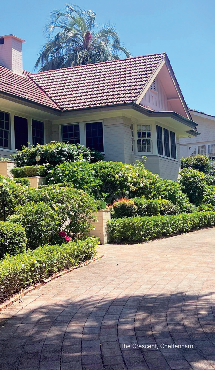
The Crescent, Cheltenham