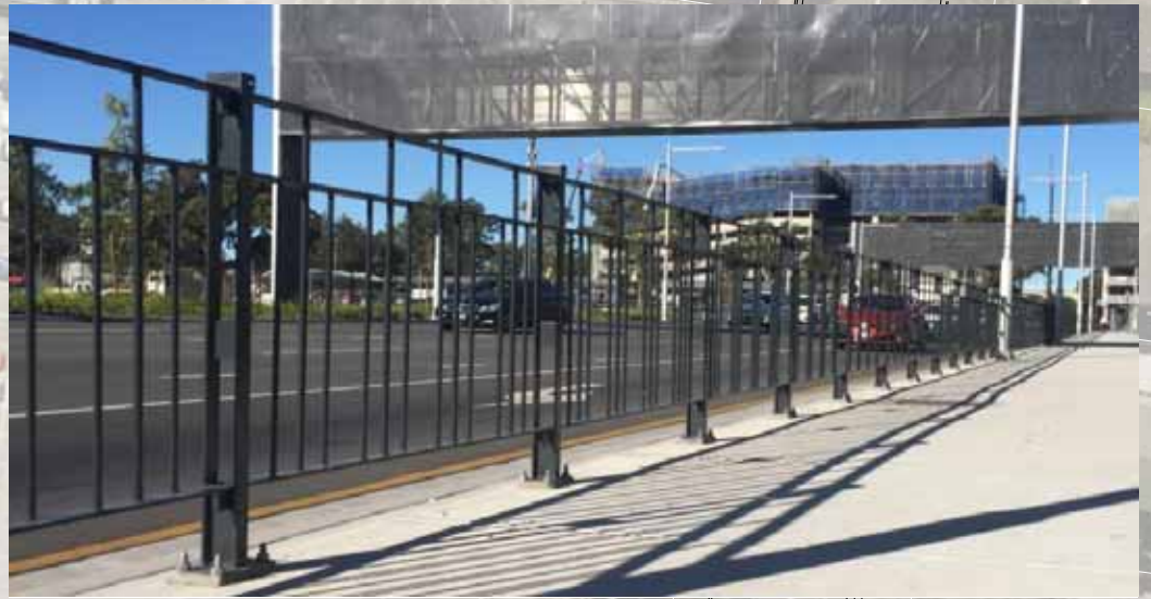
EXAMPLE OF PROPOSED PEDESTRIAN FENCING