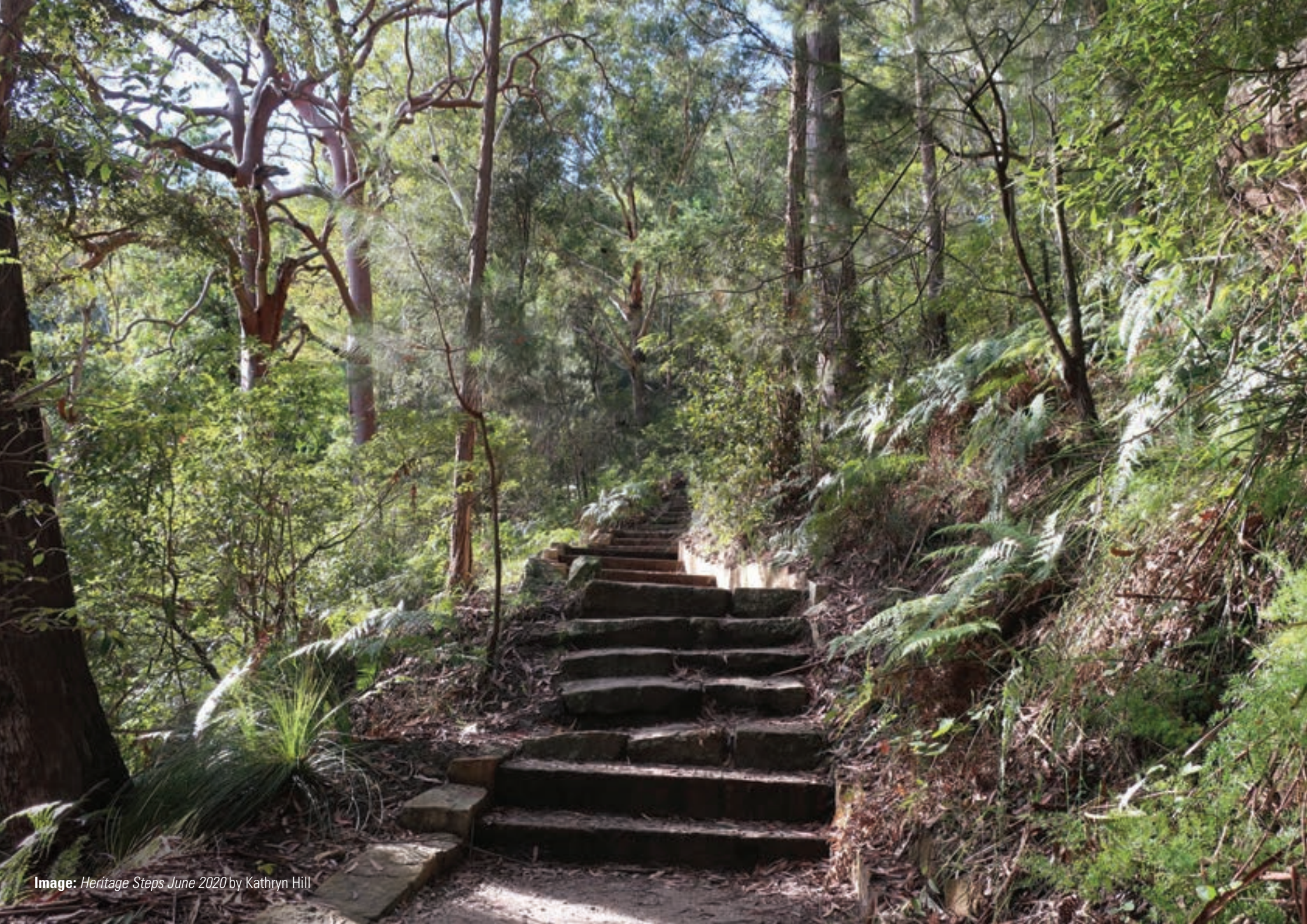
Image: Heritage Steps June 2020