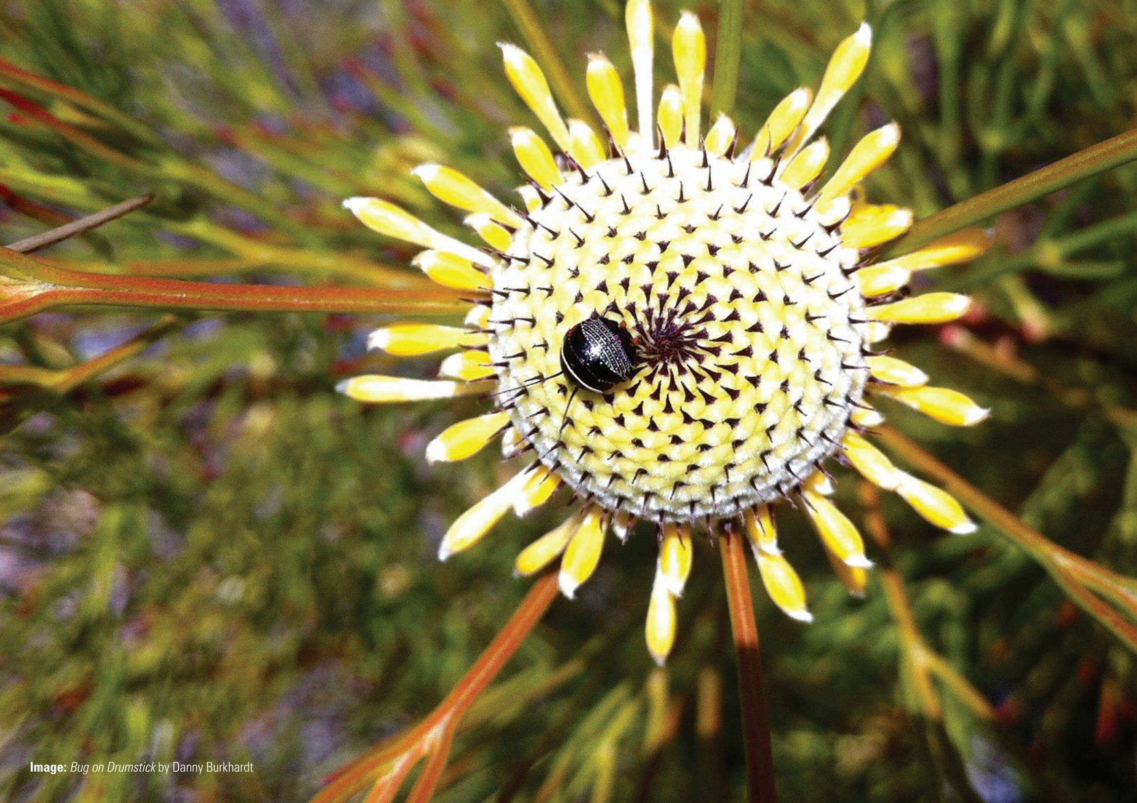
Image: Bug on Drumstick