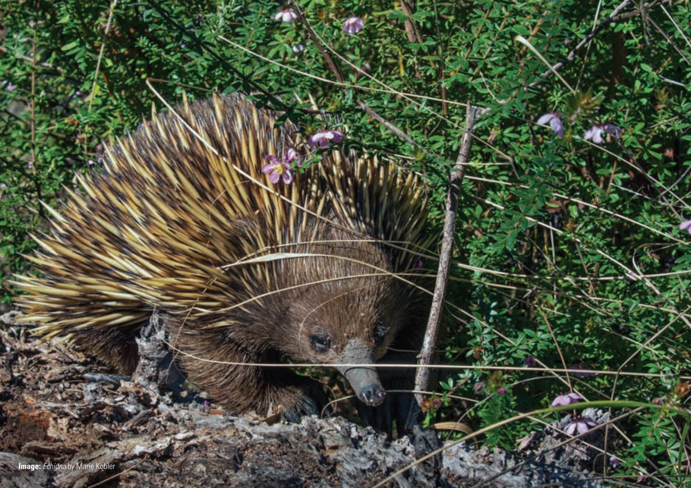
Image: Echidna