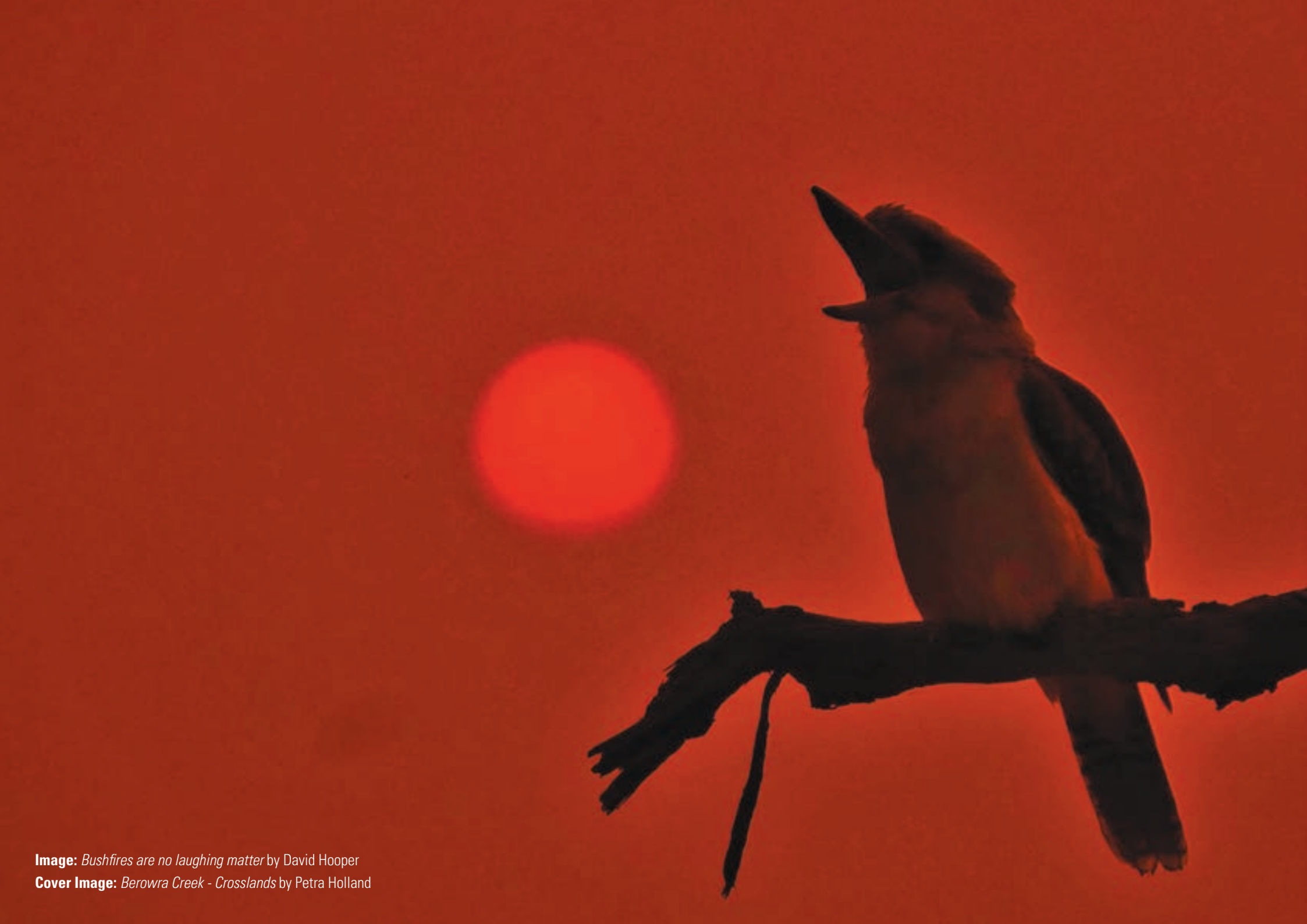
Image: Bushfires are no laughing matter

Cover Image: Berowra Creek - Crosslands