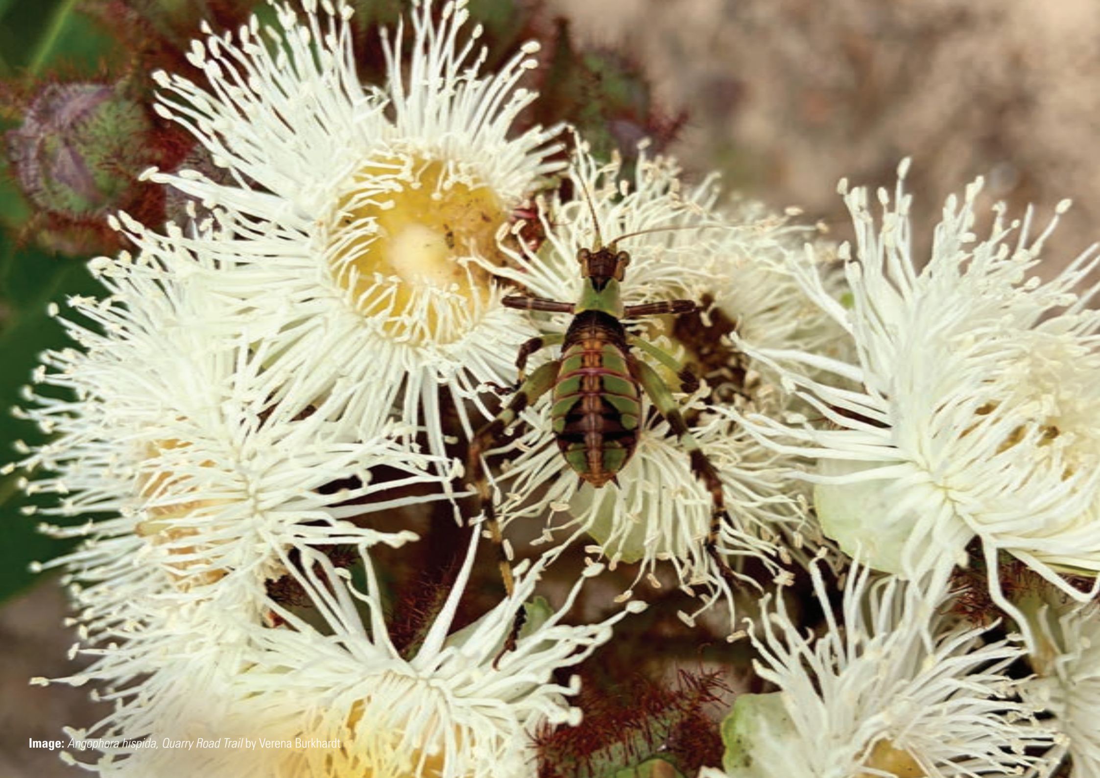
Image: Angophora hispida, Quarry Road Trail