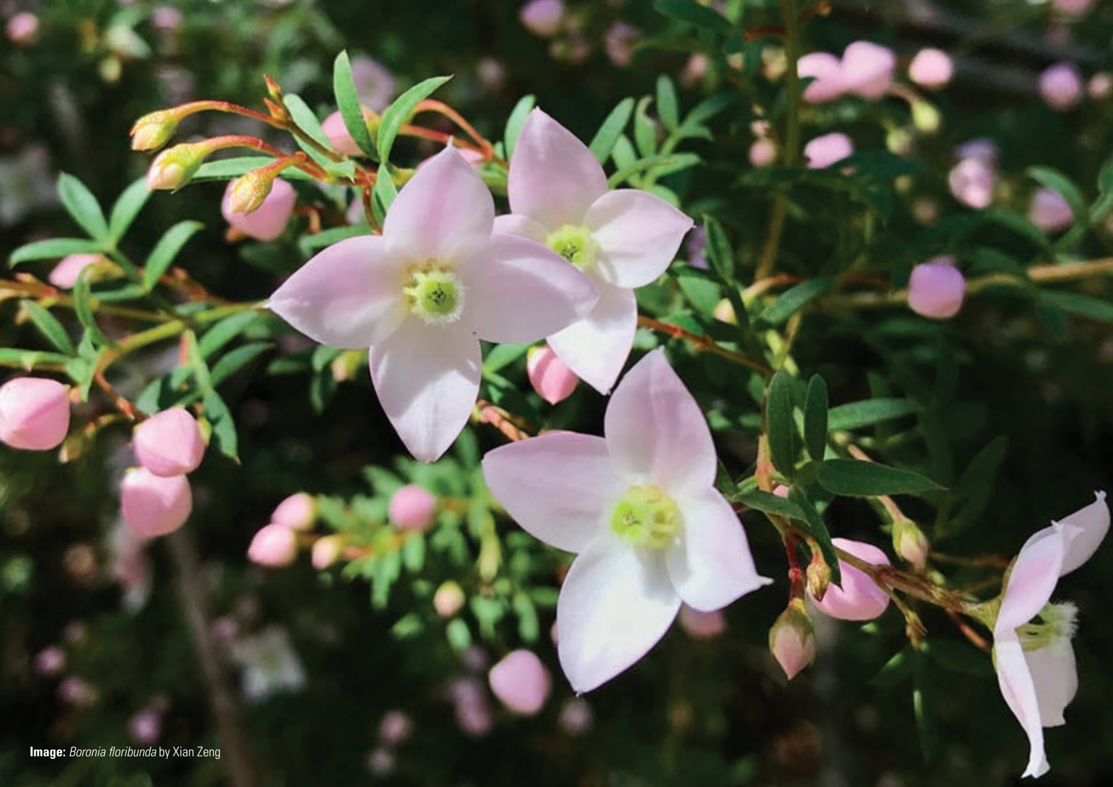
Image: Boronia floribunda