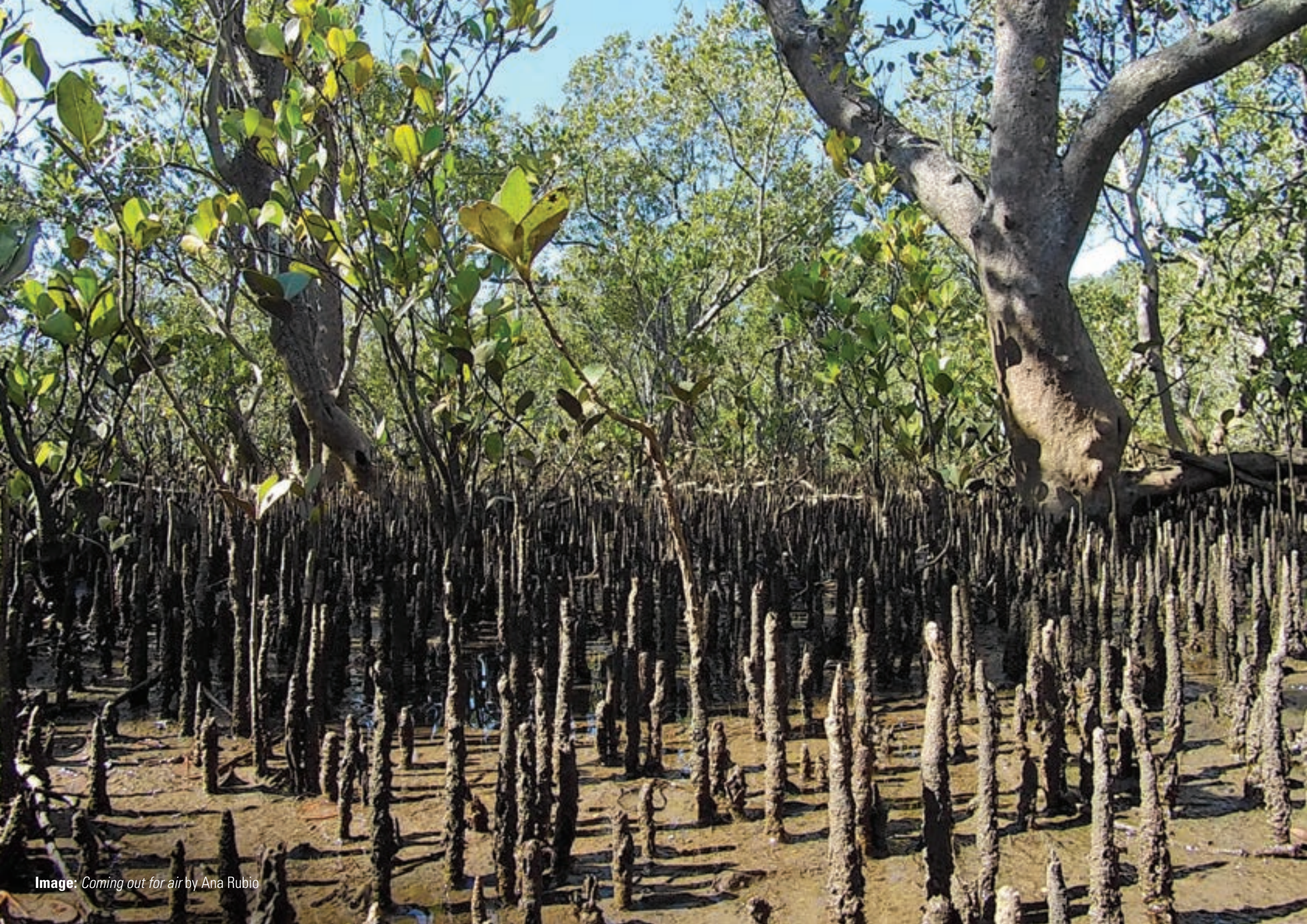
Image: Coming out for air