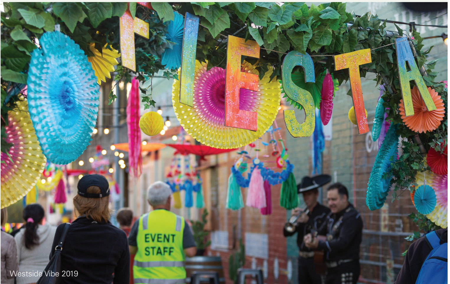
Westside Vibe 2019