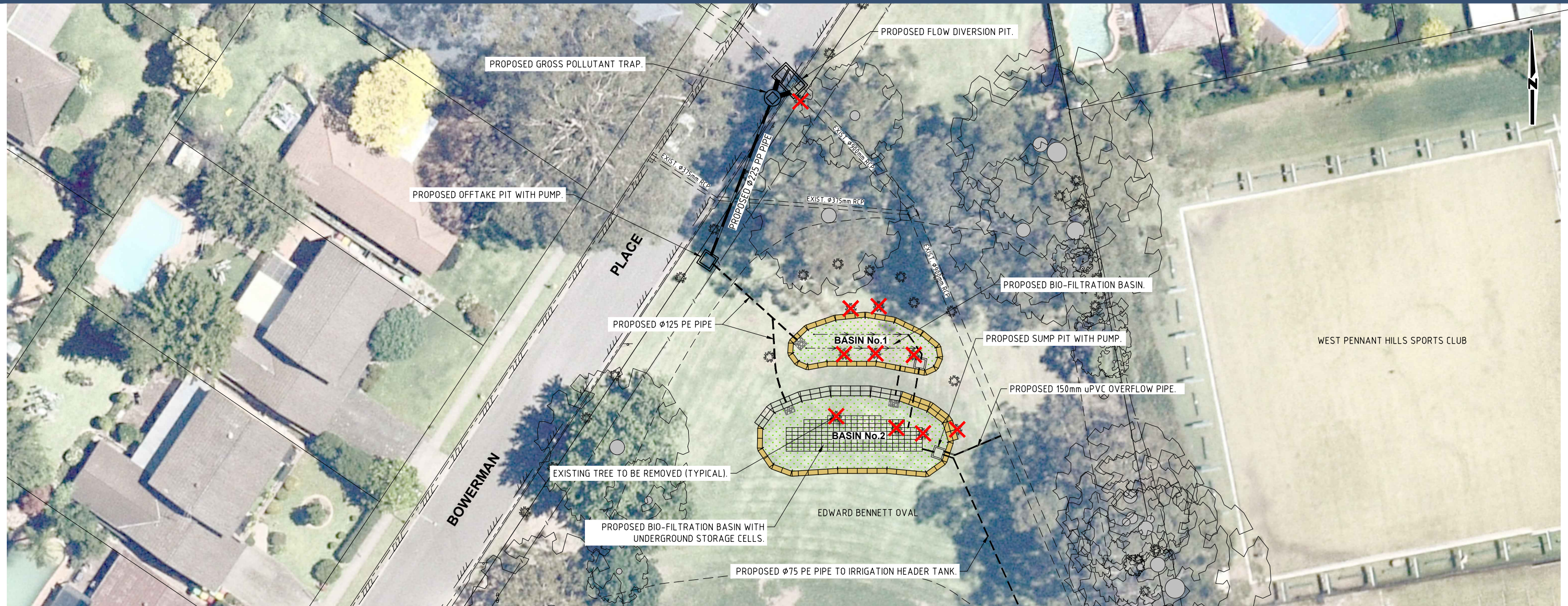
CONCEPT PLAN SCALE 1:200