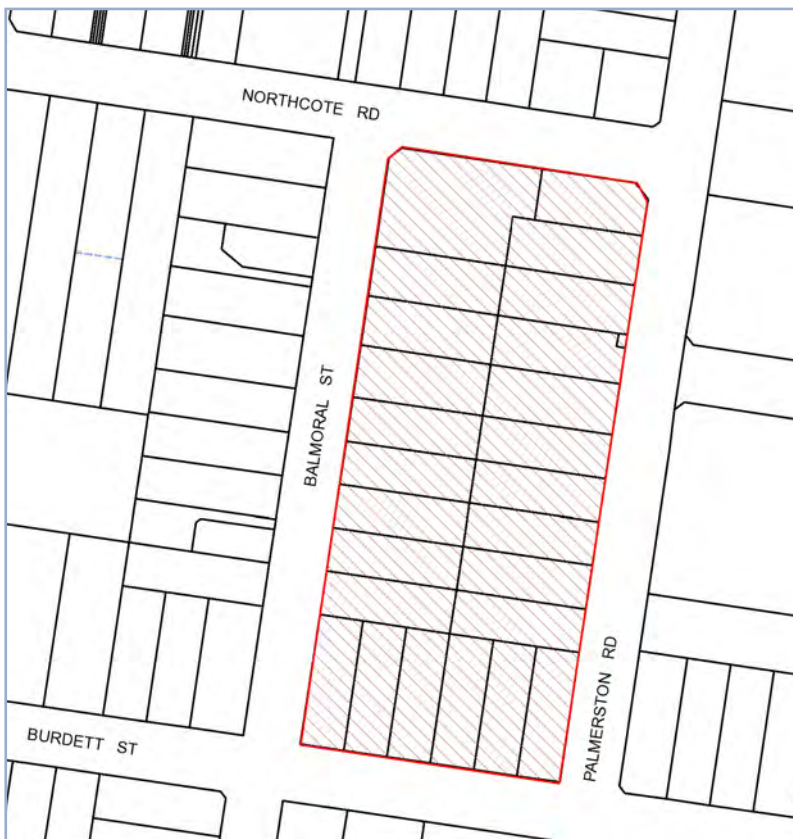
Figure 7.5(a) Location of Health Services Facility Precinct.(C)