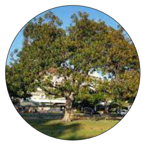
PORT JACKSON FIG