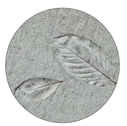
CONCRETE Grey concrete with nature themed imprints