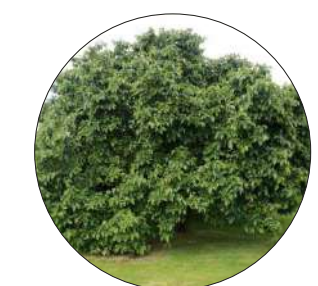
Morus nigra BLACK MULBERRY