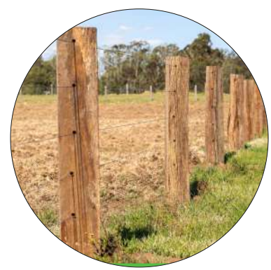
FENCE Rural style timber fence with galvanised mesh panels