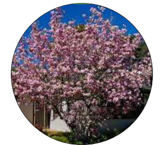
Magnolia x soulangeana TULIP MAGNOLIA