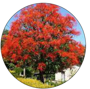
Brachychiton acerifolius ILLAWÁRRA FLAME TREE