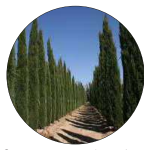
Cupressus sempervirens glauca PENCIL PINE