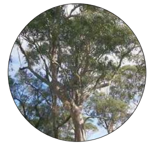
Eucalyptus punctata GREY GUM