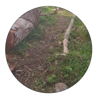
MULCHED PATH Natural mulch informal paths