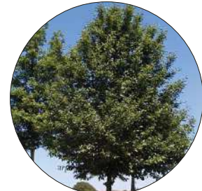
Nyssa sylvatica BLACK GUM