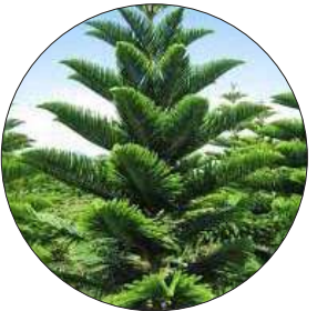
Aruaucaria heterophylla NORFOLK ISLAND PINE