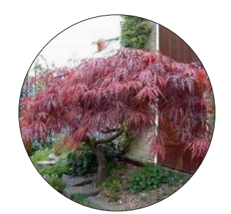
Acer 'Atropurpureum JAPANESE MAPLE