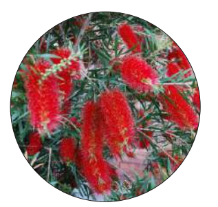
Callistemon citrinus 'Kings Park Special' KINGS PARK SPECIAL BOTTLEBRSH