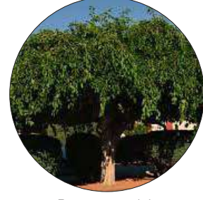
Prunus pendula WEEPING CHERRY