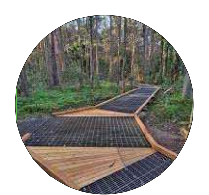
RAISED WALKWAY Fibre reinforced plastic decking with timber decking inserts