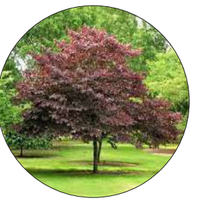
Cercis canadensis 'Forest Pansy' FOREST PANSY