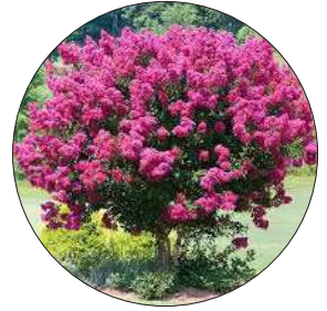
Lagerstroemia indian summer 'Biloxi' BILOXI CREPE MYRTLE