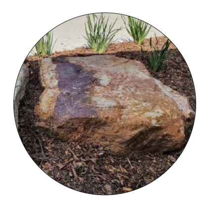
BOULDERS Flat top sandstone boulders scattered throughout garden beds.