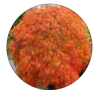
Acer palmatum JAPANESE MAPLE