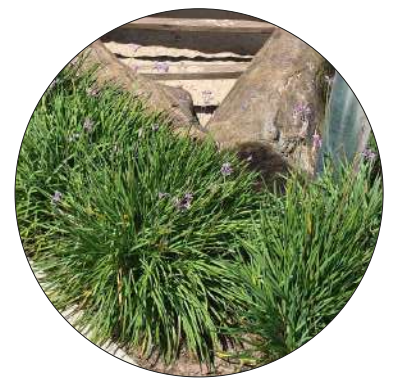
STRAPPY PLANTING Low planting