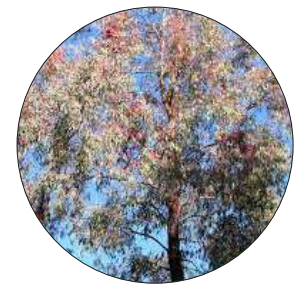
Eucalyptus sideroxylon 'Rosea' RED-FLOWERED IRONBARK