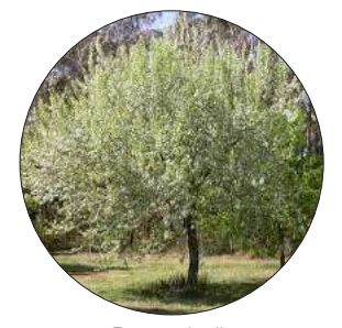
Pvrus nivalis SNOW PEAR