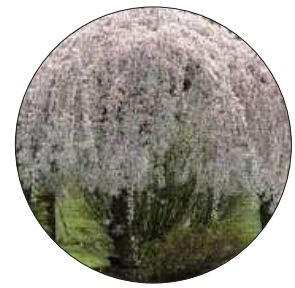
Prunus snofozam 'Snow Fountain' WEEPING CHERRY TREE