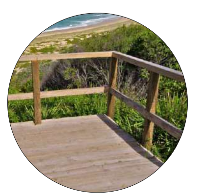
TIMBER DECKING Durability Class 1 or 2 timber. No timber in ground