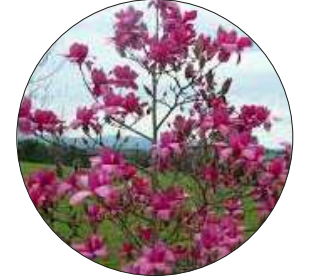
Magnolia x soulangeana 'Vulcan' VULCAN MAGNOLIA