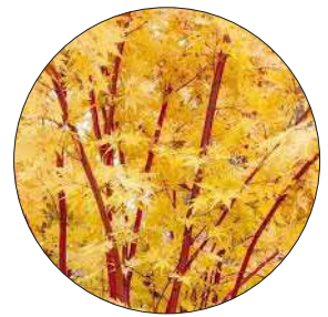
Acer palmatum 'Sango Kaku' Acer rubrum 'October Glory' CORAL BARK MAPLE OCTOBER GLORY RED MAPLE