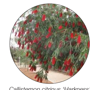
Callistemon citrinus 'Harkness' HARKNESS BOTTLEBRUSH