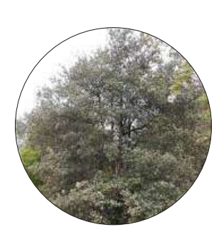
Syncarpia glomulifera TURPENTINE TREE