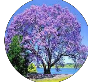
Jacaranda mimosofolia JACARANDA