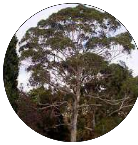
Corymbia maculata SPOTTED GUM