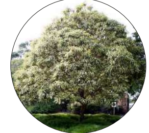
Lophostemon confertus BRUSH BOX