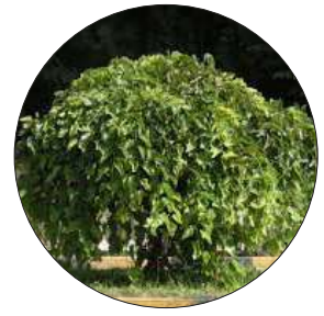
Morus alba 'Pendula' WEEPING MULBERRY