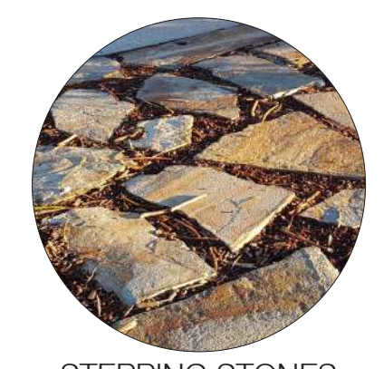
STEPPING STONES Sandstone stepping stones, natural shape with mulch infill