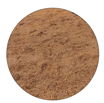
PLAYGROUND MULCH 300mm playground mulch for equipment over 0.6m in height