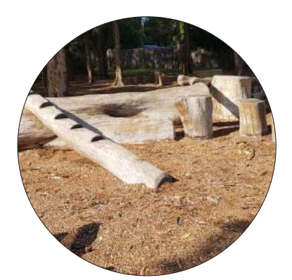
GARDEN BED MULCH Garden bed mulch for low nature play items