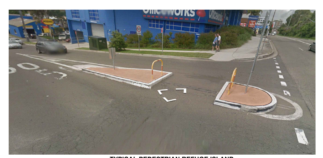
TYPICAL PEDESTRIAN REFUGE ISLAND PHOTOGRAPH OF TYPICAL PEDESTRIAN REFUGE ISLAND

PRELIMINARY NOT FOR CONSTRUCTION ISSUED FOR INFORMATION ONLY