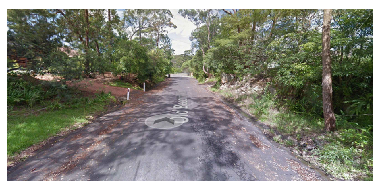
OLD BEECROFT ROAD LOOKING SOUTH FROM OPPOSITE No.25