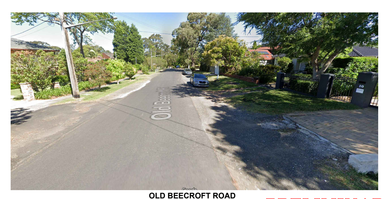
OLD BEECROFT ROAD LOOKING SOUTHEAST FROM BEECROFT ROAD