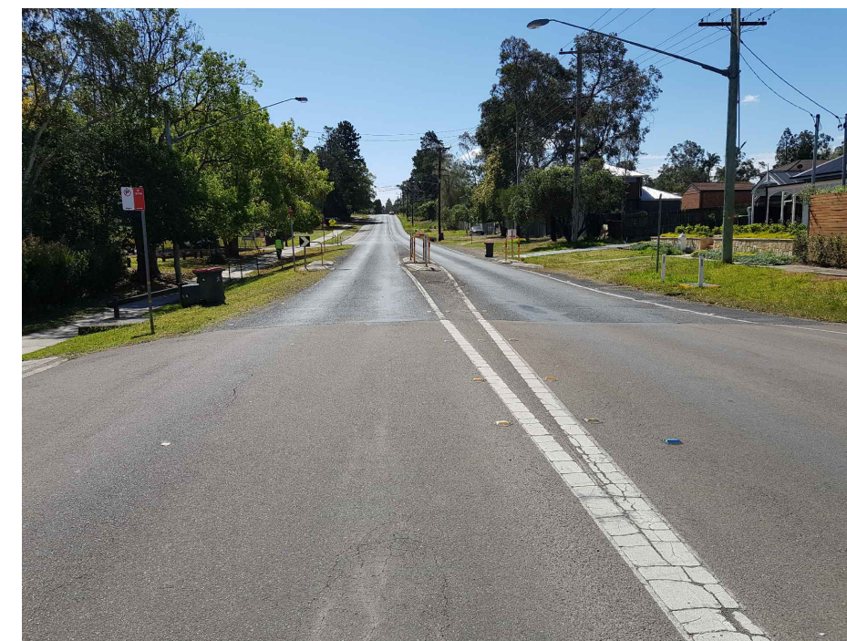
LOOKING NORTH FROM MARTIN ROAD INTERSECTION