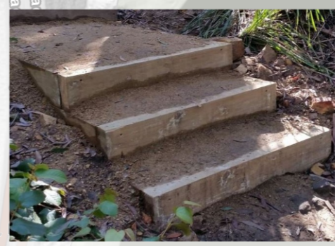
Example - Timber Steps

Natural Resources Branch Hornsby Shire Council 296 Peats Ferry Road, Hornsby PO Box 37, Hornsby NSW 1630 Telephone 9847 6666 8.30am - 5pm Mon-Fri hornsby.nsw.gov.au