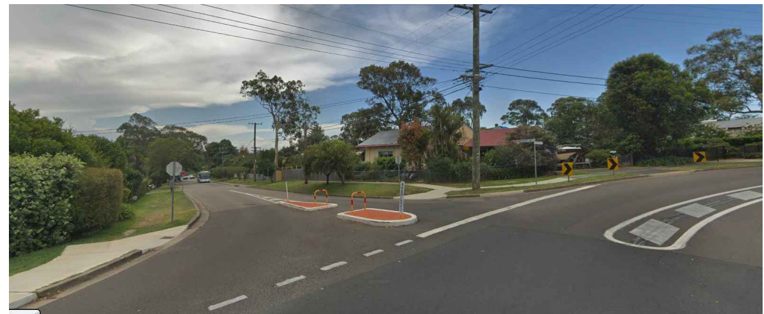
EXAMPLE OF RAISED PEDESTRIAN REFUGE ISLAND