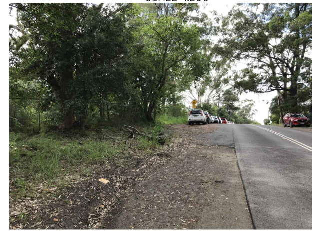
SITE PHOTO - LOOKING SOUTH ON THE CRESCENT