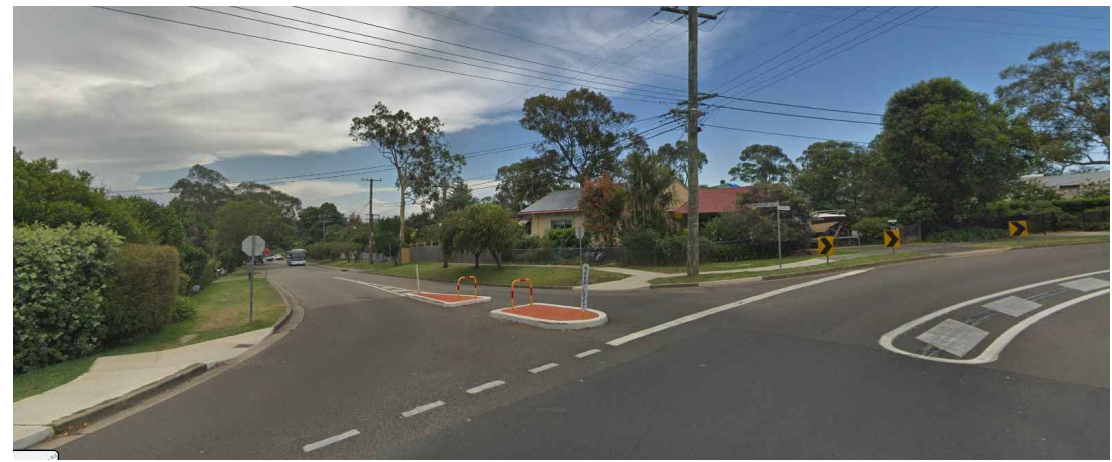
EXAMPLE OF RAISED PEDESTRIAN REFUGE ISLAND