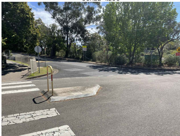
SITE PHOTO OF EXISTING INTERSECTION