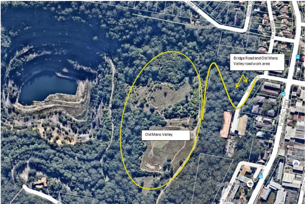
Hornsby Quarry access and Old Mans Valley bike path changes and site fence